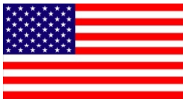
United State of America